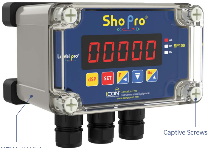
NEMA 4X High Impact Enclosure